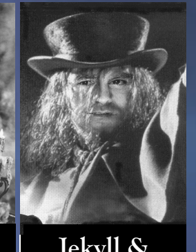
Jekyll & Hyde